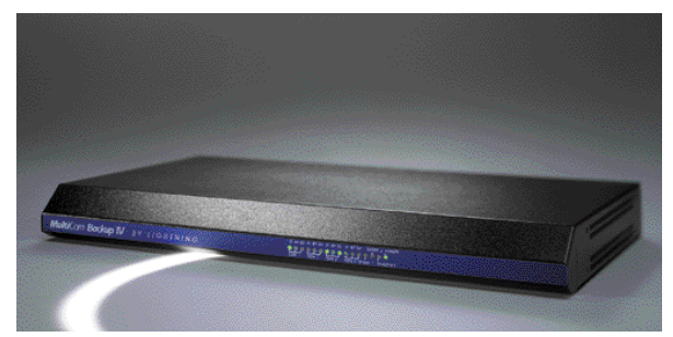
MultiCom Backup IV: the secure solution for Virtual Private Networks.

Many companies today have Intranets to exchange information throughout the company. Remote locations of such networks are connected over public networks, for example leased lines or ISDN connections provided by telecom operators. In some cases it is more cost effective to use the Internet between remote locations, which leads to so-called Virtual Private Networks.